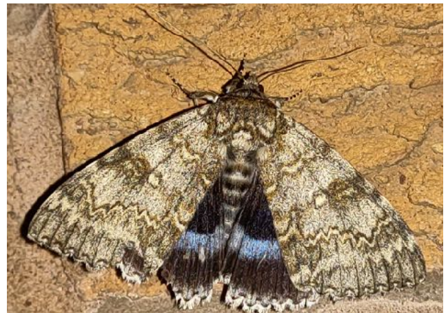
Clifton Nonpareil - Matt Leedell

Steve Thorpe trapped a few migrants on 8th at Breaston, including a Dark Sword-grass , and 2 Diamond-back Moth . Also recording 50+ Box Tree Moth and 20+ Centre-barred Sallow .