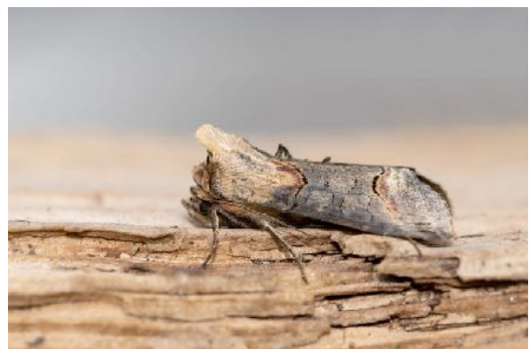
Dark Spectacle - Neil Loverock