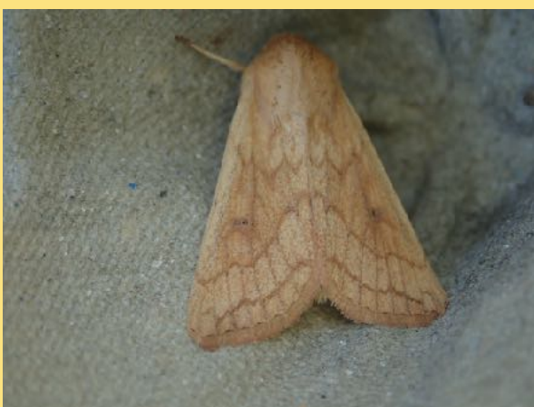
Delicate - Steve Orridge

Well, there we have it, another cracking month of Derbyshire moths, including some superb migrants and an array of good autumn species. Many thanks to all the county recorders who continue to support the Derbyshire Moths Facebook Group.