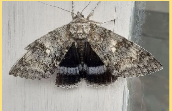
Clifden Nonpareil - Clive Ashton