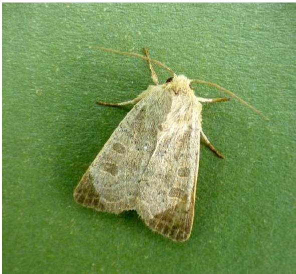
Vine's Rustic - aberration