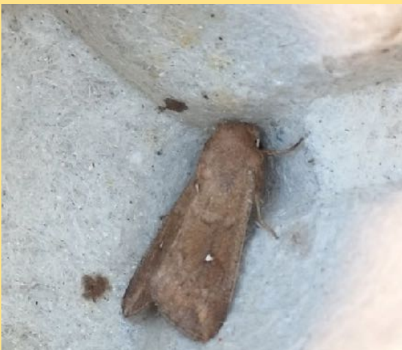
White-point