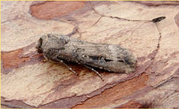
Dark Sword-grass - Dave Evans

September Early autumn - By the end of the month the final records, of what has been another amazing month for Derbyshire Moth Recording, were still pouring in.