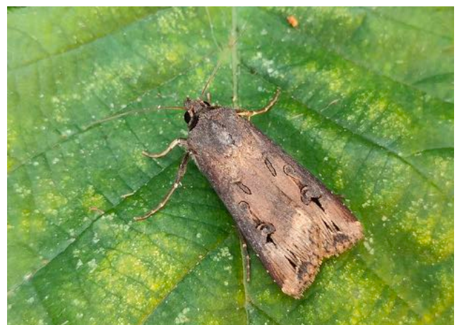
Dark Sword-grass