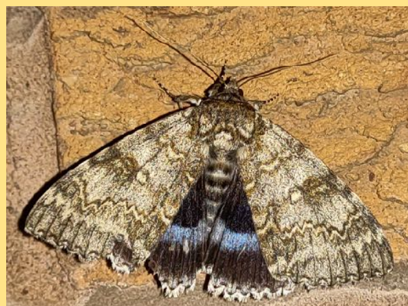
Clifden Nonpareil - Matt Leedell - Belper