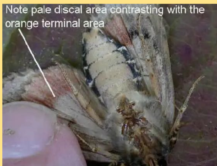
Copper Underwing - Simon Roddis

Copper Underwing Amphipyra pyramidea . The copper/orange suffusion is limited to the outer third of the under hind-wing, forming a marginal band, and ends abruptly at the dark cross-band. The remaining basal two-thirds is straw-coloured, apart from a grey-brown speckled streak along the leading edge which gives a contrasting effect.