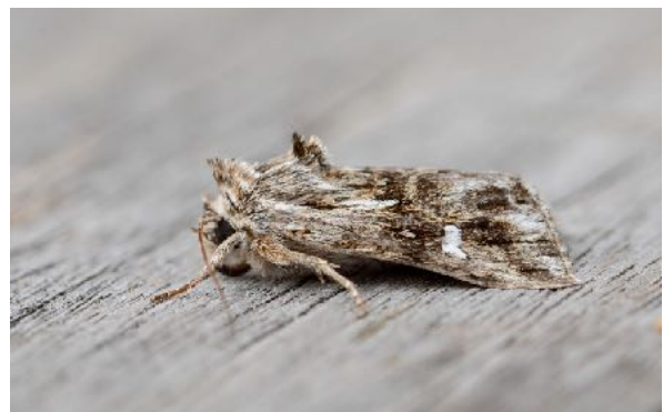
Toadflax Brocade - Neil Loverock