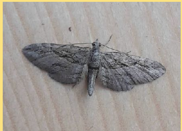
Cypress Pug - Clive Ashton

Clive Ashton trapped another Cypress Pug at Cromford on 11th (4th record for Derbyshire).