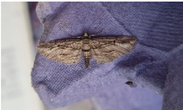
Cypress Pug - Emily-Louise Milnes