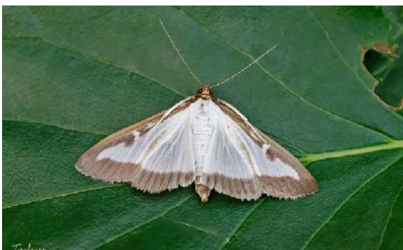
Box Tree Moth