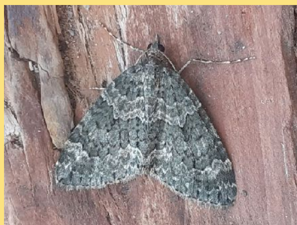
Autumn Green Carpet - Clive Ashton