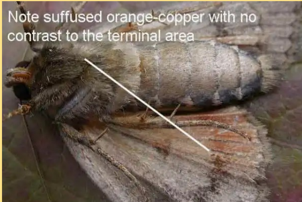
Svensson's Copper Underwing - Simon Roddis

Svensson's Copper Underwing Amphipyra berbera svenssoni . The copper/orange suffusion continues towards the base in trailing half, with a lack of any contrast, and without any sign of a marginal band.