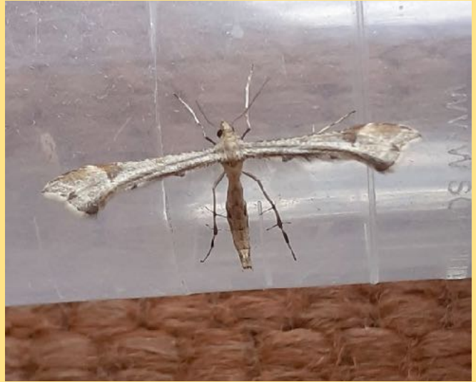
Triangle Plume - Clive Ashton