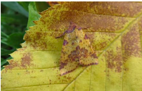
Pink-barred Sallow - Nikki Barrow