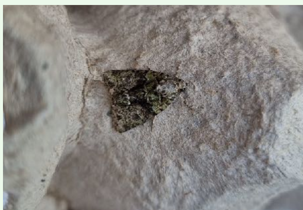
Tree Lichen Beauty - Sandiacre - Emily Louise Milnes