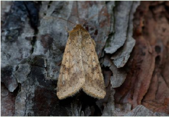
Scarce Bordered Straw