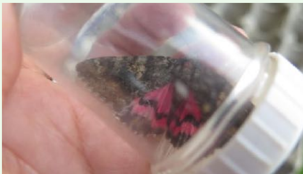
Dark Crimson Underwing - Shirland

The second new macro moth species for the county, during the year, was a DARK CRIMSON UNDERWING at Shirland on 10th. Eight records of DEWICK'S PLUSIA were also recorded during August and September, an unprecedented number for Derbyshire, especially as it was only first recorded in the county in 2022.