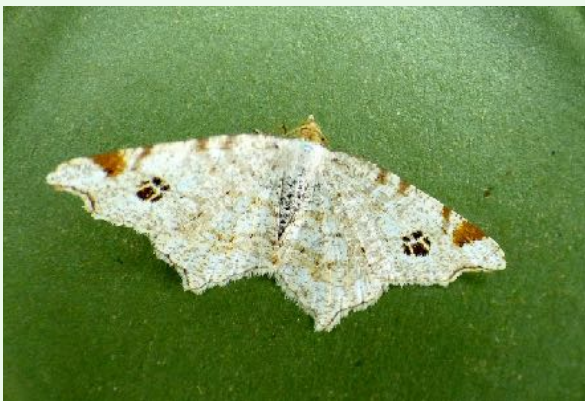
Peacock Moth - Findern - Brian Hallam