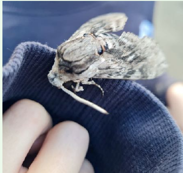
Convolvulus Hawkmoth - Simon Roddis