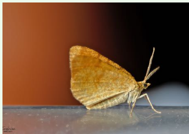
Rannoch Looper - 3rd county record