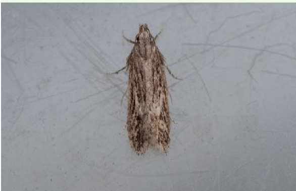
Gelechia senticetella - Chaddesden - Neil Loverock

The following micros were all recorded from the same Chaddesden garden on 27 July, Carpatolechia alburnella (35.149) was probably a second county record, Gelechia senticetella (35.099) has less than 10 county records and Bucculatrix nigricomella (14.002) 5 previous records, Finally a TREE LICHEN BEAUTY on 30th from a garden light trap in Sandiacre.