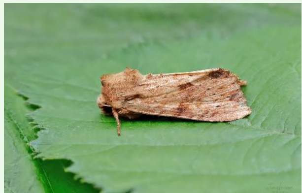
Reddish Light Arches - Sandiacre