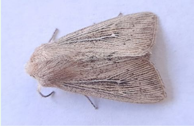
Obscure Wainscot - The late Claire Miles

There are three wainscot species that are now spreading across the county and getting recorded with more regularity. These are Obscure Wainscot , Silky Wainscot and Southern Wainscot .