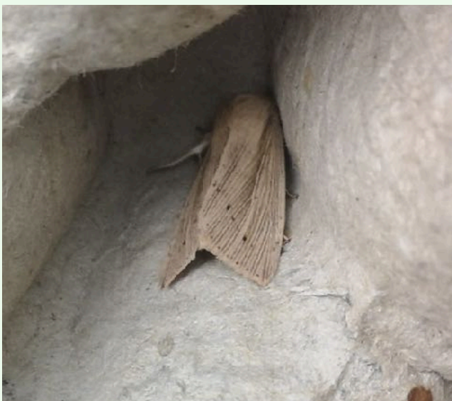
Southern Wainscot - Sid Morris