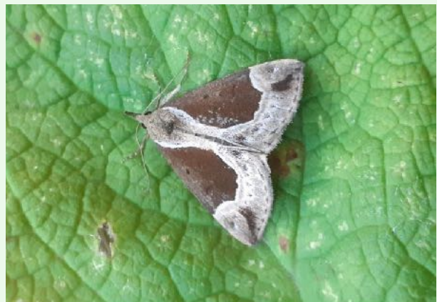
Beautiful Snout - Cromford - Clive Ashton