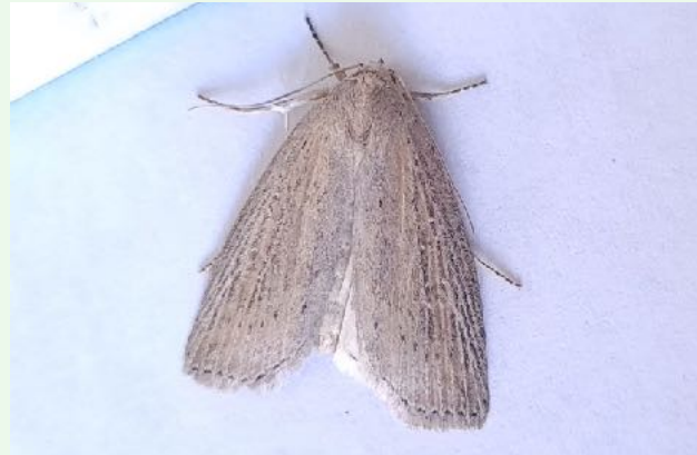
Silky Wainscot - The late Claire Miles