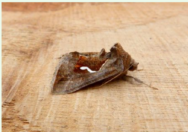
Dewick's Plusia - Belper - Dave Evans

MAPLE PUG from Ripley on 29th was the first record since 2021. The Olive is another scarce species with only two reports being received, and seven more TREE LICHEN BEAUTY from Sandiacre on 11th. Small numbers of Angle-striped Sallow were noted, probably indicating that this species is beginning to spread across Derbyshire. A Pearly Underwing , probably a migrant, was recorded at Mickleover on 27th.