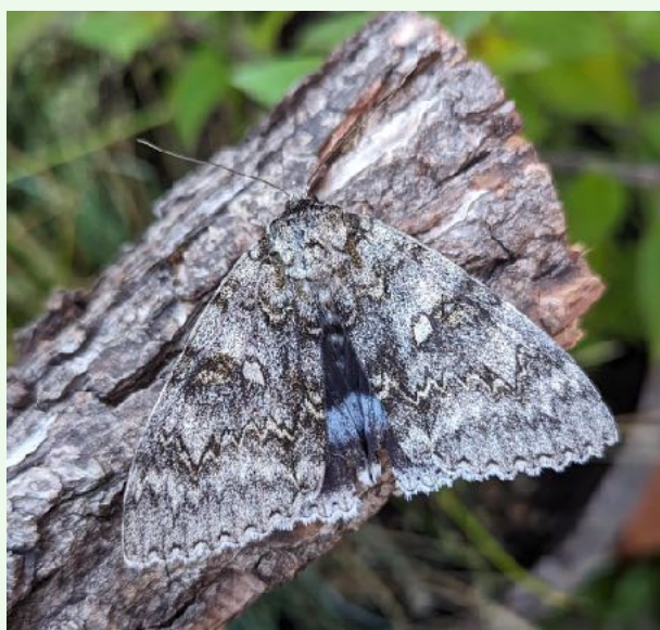
Clifden Nonpareil