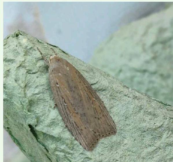
Silky Wainscot - Steve Thorpe

During 2023 there were 14 records from 3 sites of Southern Wainscot , all down the eastern side of the county. Obscure Wainscot , there were 7 records from 3 sites and Silky Wainscot 17 records from 7 sites, with 4 sites all down the eastern side of the county. The stronghold for all three species appears to be an area around Breaston and Long Eaton, with Steve Thorpe submitting the majority of records of all three species. All data has come from iRecord . The late Claire Miles light trapped Obscure and Silky from her Hathersage garden during 2023, two very odd ball records, possibly indicating wanderers or migrants?