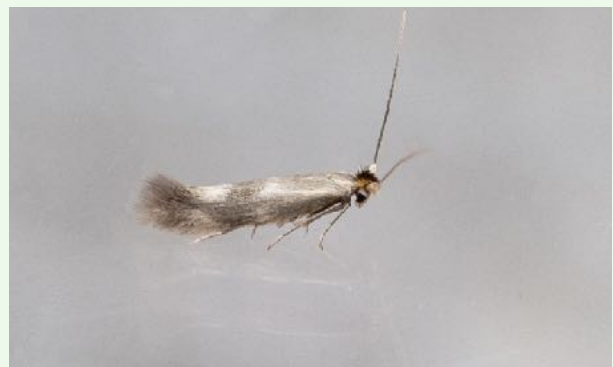
Bucculatrix nigricomella - Chaddesden