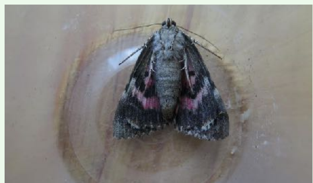
Dark Crimson Underwing - Shirland - Nikki Barrow