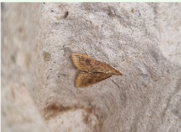
Rusty Dot Pearl - Emily Louise Milnes