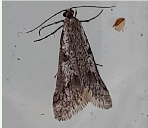
Exapate congelatella