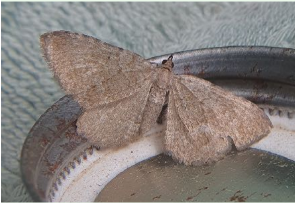
Brown Scallop - Sandiacre