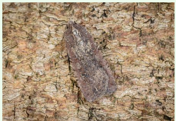
Pearly Underwing - Christime Maughan