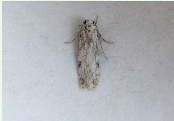
Carpatolechia alburnella - Neil Loverock

The following micros were all recorded from the same Chaddesden garden on 27 July, Carpatolechia alburnella (35.149) was probably a second county record, Gelechia senticetella (35.099) has less than 10 county records and Bucculatrix nigricomella (14.002) 5 previous records, Finally a TREE LICHEN BEAUTY on 30th from a garden light trap in Sandiacre.