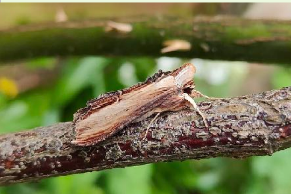
Mullein