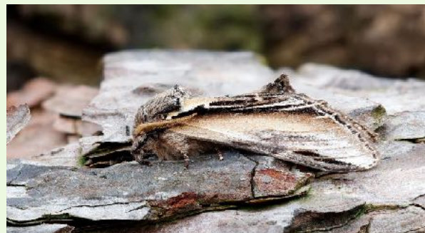
Swallow Prominent

The 100th species for the year turned up on 30 April when Small Phoenix was discovered, along with 3 Flame Shoulder , 4 Green Carpet , Knot Grass , Chocolate-tip and a V-Pug . All new species for the year from Sid Morris and team at Hall Lane ponds, Staveley.