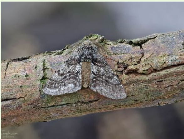
Brindled Beauty