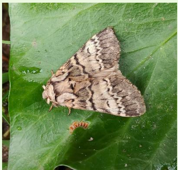
Lunar Marbled Brown