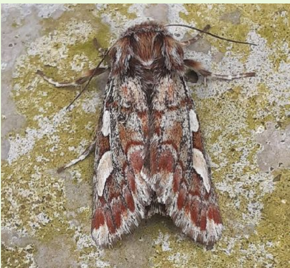
Pine Beauty - Clive Ashton©

On 5 April Brian Hobby from Kirk Hallam had another, or possibly a re-catch, Mullein , along with 2 Tawny Pinion , Beautiful Plume , Oak Nycteoline , Brindled Beauty as other highlights from 24/9. The 5 April seemed to be a very popular night for moth trapping. Clive Ashton from Cromford recorded a superb example of Pine Beauty , along with a Yellow-barred Brindle and Brindled Pug , as other highlights from 27/15.