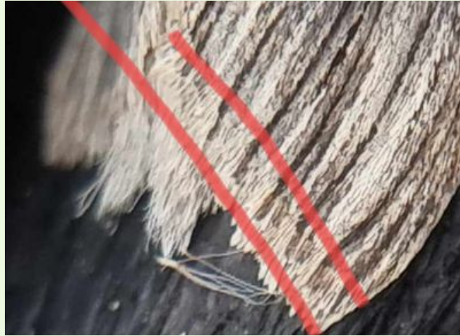
Chamomile Shark