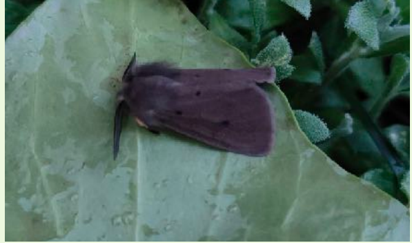
Muslin Moth