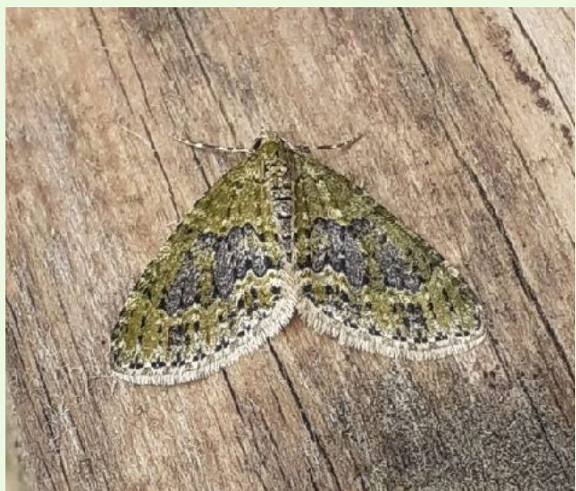
Yellow-barred Brindled