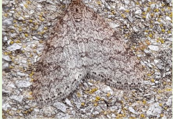
Mottled Grey