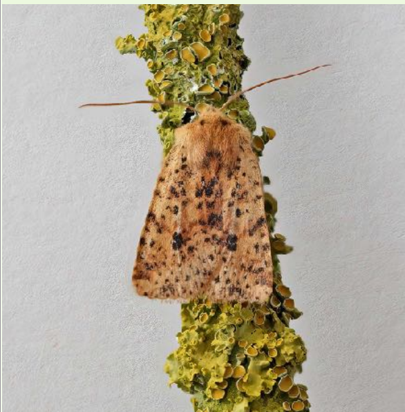
Dotted Chestnut