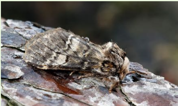
Lunar Marbled Brown