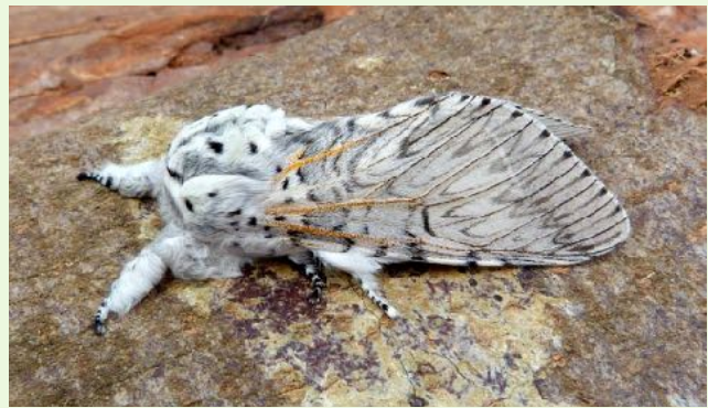
Puss Moth