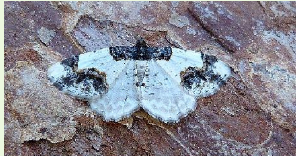
Scorched Carpet