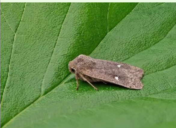
Satellite