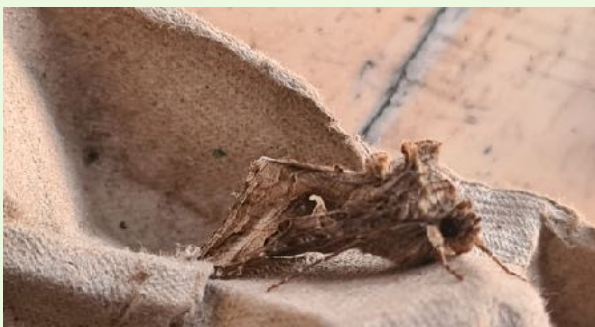
Silver Y