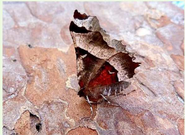
Purple Thorn