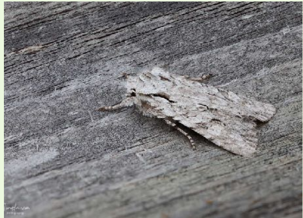
Grey Shoulder-knot

On 5 April Brian Hobby from Kirk Hallam had another, or possibly a re-catch, Mullein , along with 2 Tawny Pinion , Beautiful Plume , Oak Nycteoline , Brindled Beauty as other highlights from 24/9. The 5 April seemed to be a very popular night for moth trapping. Clive Ashton from Cromford recorded a superb example of Pine Beauty , along with a Yellow-barred Brindle and Brindled Pug , as other highlights from 27/15.